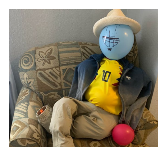
That's it! You're ready for a "popping" New Year's Eve!

8. Accessorize your Año Viejo however you want! Add a hat, a tiara, a scarf, or belt. Give it hair with some yarn. Use gloves to give it hands. Get creative!